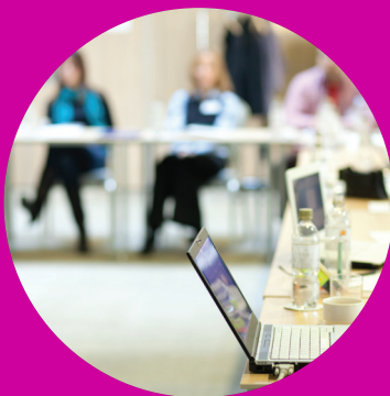
SHORT TRAINING COURSES