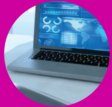
E-LEARNING MODULES ON HOT TOPICS