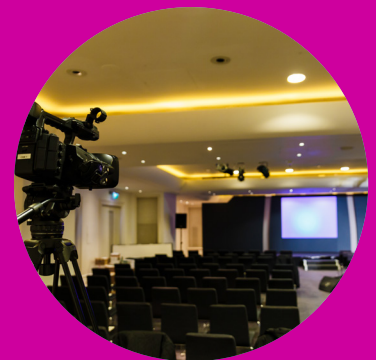
LIVE AND RECORDED CONFERENCES AND EVENTS