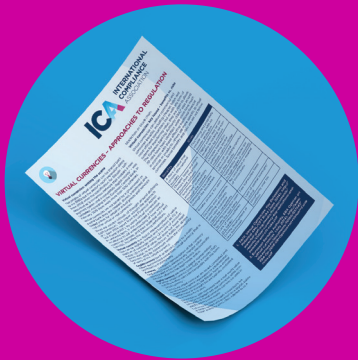
IN-DEPTH REPORTS AND WHITE PAPERS