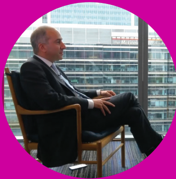
INTERVIEWS WITH THOUGHT LEADERS