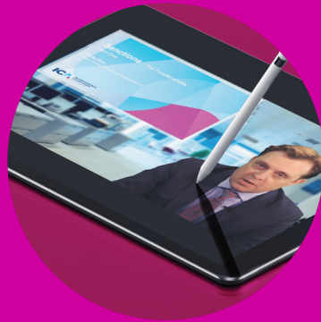
E-BOOKS AND BITE-SIZED WEBINARS